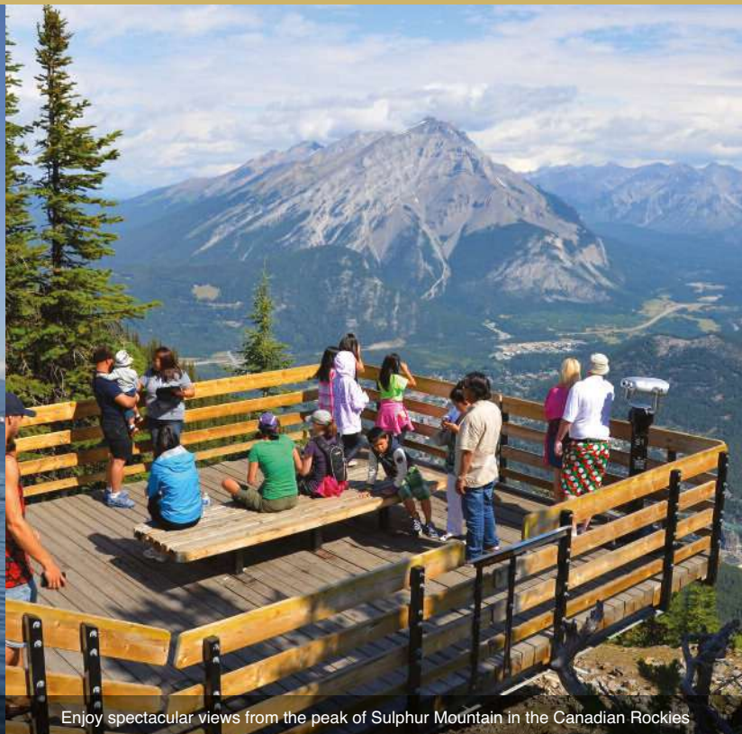
Enjoy spectacular views from the peak of Sulphur Mountain in the Canadian Rockies

mental Divide. Beyond Craigellachie is Rogers Pass with its tunnels, glistening glaciers, and snow-capped mountains. After Craigellachie, where the “last spike” was driven completing the Canadian Pacific Railway in 1885 you pass through the vast ranchlands to Shuswap Lake. Overnight in Kamloops. Meals: B, L