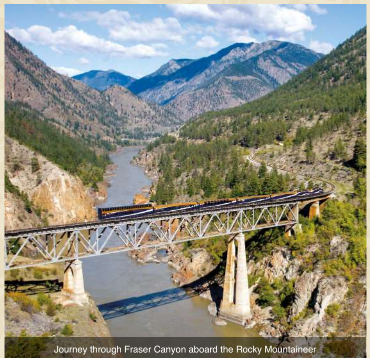
Journey through Fraser Canyon aboard the Rocky Mountaineer

Following breakfast, depart Canada with a group transfer to the Vancouver Airport for flights out after 12:00 p.m. Meal: B