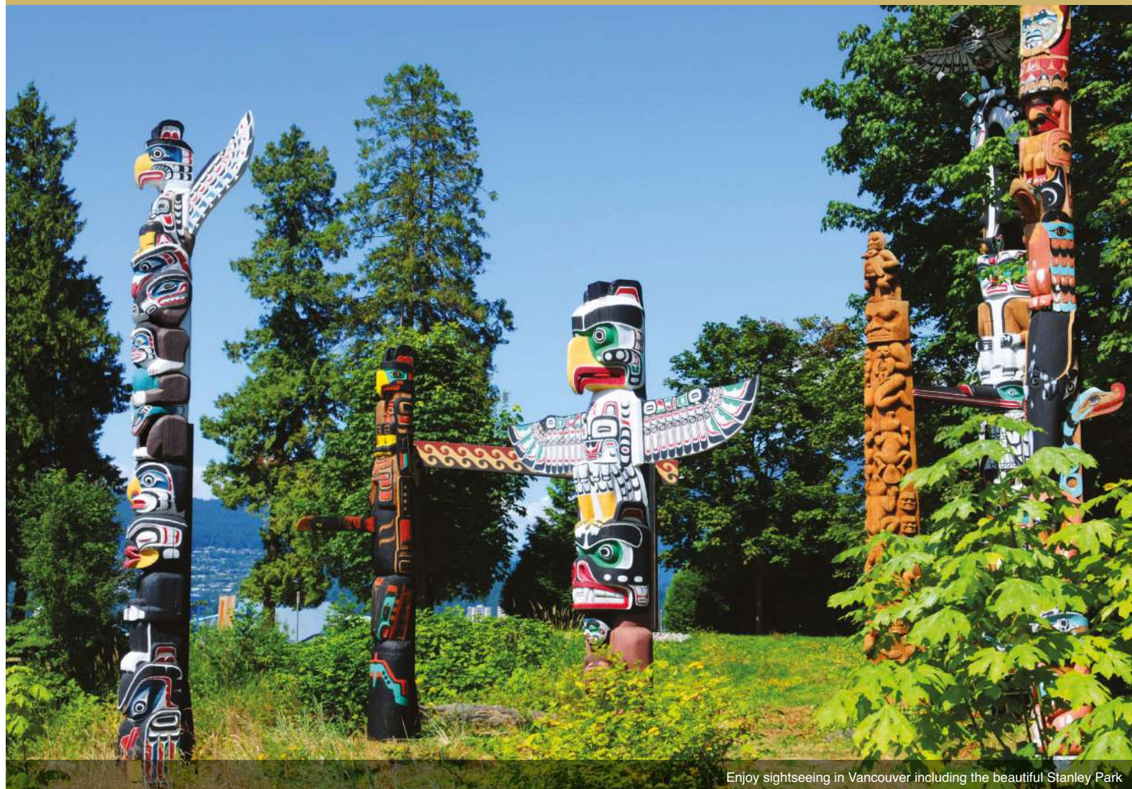
Enjoy sightseeing in Vancouver including the beautiful Stanley Park