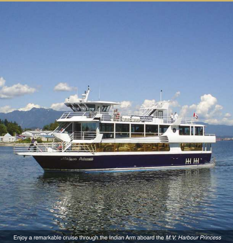
Enjoy a remarkable cruise through the Indian Arm aboard the M.V. Harbour Princess